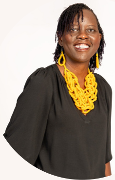
The UN Independent Expert on Albinism