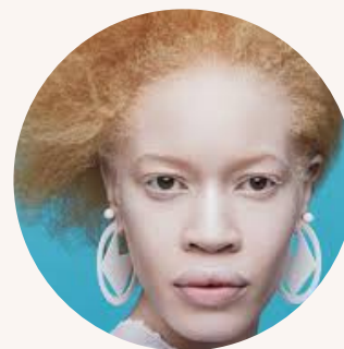
Diandra Forrest - Model and Activist