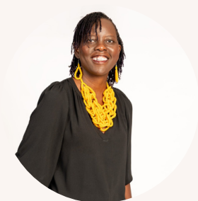
The UN Independent Expert on Albinism