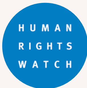
Human Rights Watch