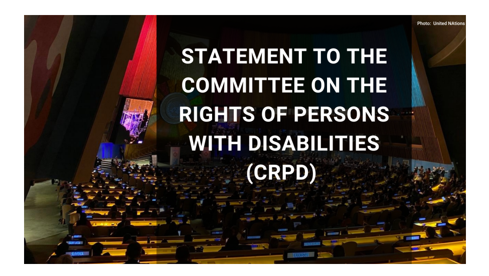
Read The Full Report

In July 2023, AAN and APAM jointly submitted a report during the 29th session of the CRPD review of Malawi. This report builds on the 2020 report submitted by Under the Sam Sun (UTSS) and APAM. The report calls upon Malawi to strengthen the implementation of the National Action Plan for Persons with Albinism and to create an enabling environment for the enjoyment of their rights, including the most fundamental, namely right to life.