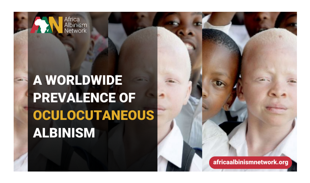
Read the Review