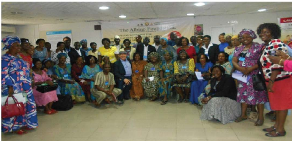
Group photographs of participants at the sensitisation workshop for Teachers