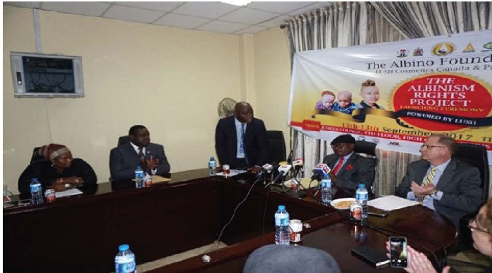
Dignitaries at the Albinism Rights Project Launch