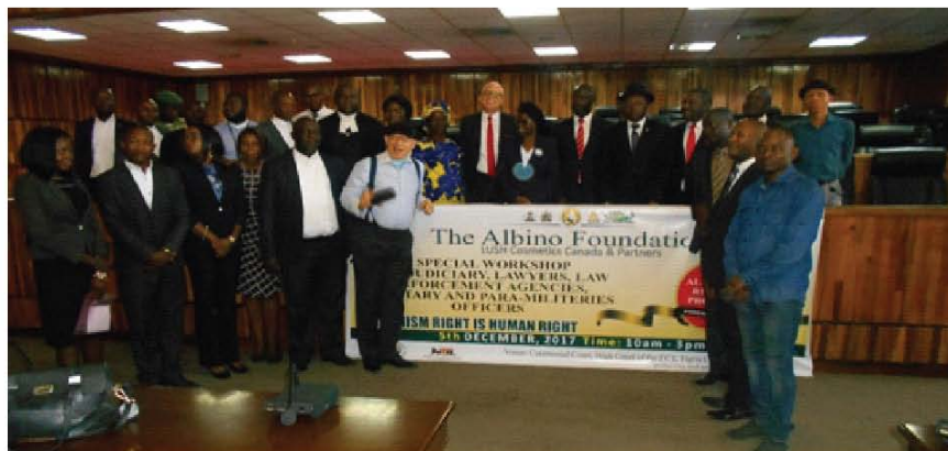
Group Photographs of participants at the workshop