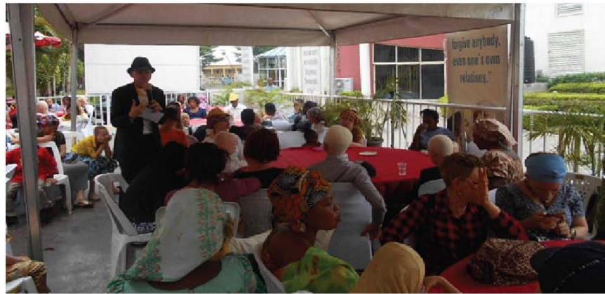
A Cross Section of Participants during the National Albinism Day Celebration

Highlight of the programme was a press conference by the foundation to sensitize the public and the media about the day. There were equally talks from persons with albinism who have made it in live to other members of the albinism community to build their self-esteem.