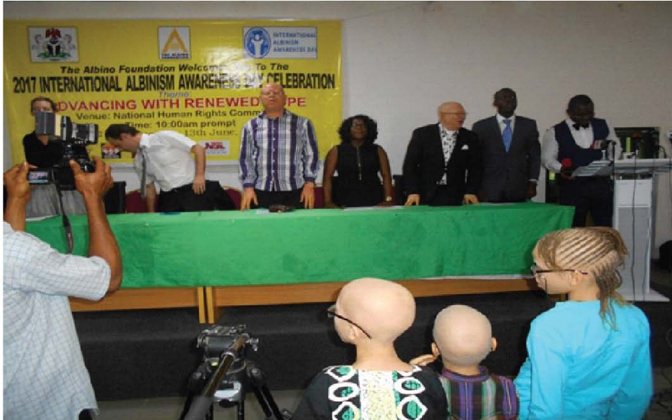
Dignitaries at the 2017 International Albinism Day Celebration

The 2017 IAAD Celebration was one of the several events organised by TAF during the year. The Importance of the IAAD is to raise the consciousness of people worldwide concerning the negative impacts of the widespread discrimination, stigmatization, dehumanization, human right abuse and brutal killings of persons with albinism (PWAs) around the world especially in Africa.