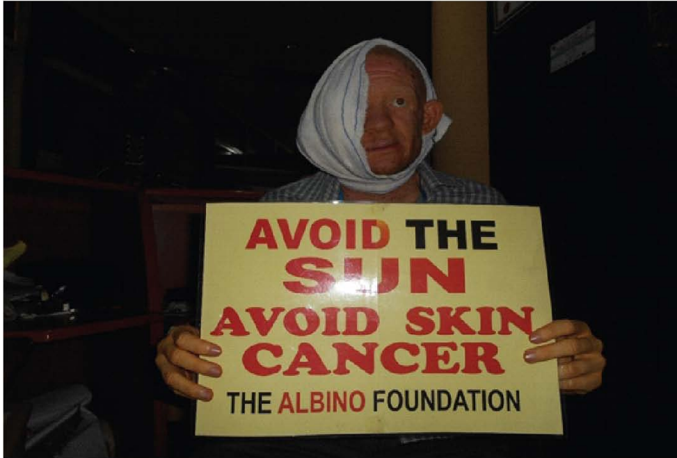
A person with albinism affected with Skin Cancer

The free skin cancer programme with the National Hospital has been the foundation's biggest achievement over the years. This is as a result of the number of deaths that has been averted due to skin cancer among persons with albinism. During the year 2017, the foundation was able to refer 35 persons with albinism (20 males and 15 females) affected with skin cancer for treatment at the National Hospital, Abuja. With this new treatment, 3700 persons with albinism affected with skin cancer have been treated since the inception of the programme in 2007. Though, there are more persons with albinism affected with skin cancer seeking for treatment, the foundation is seeking for funding and partnership to ensure that those that cannot be reached especially those at the hinterlands have access to this treatment by working towards ensuring that federal teaching hospitals across the country mainstream persons with albinism into their facilities.