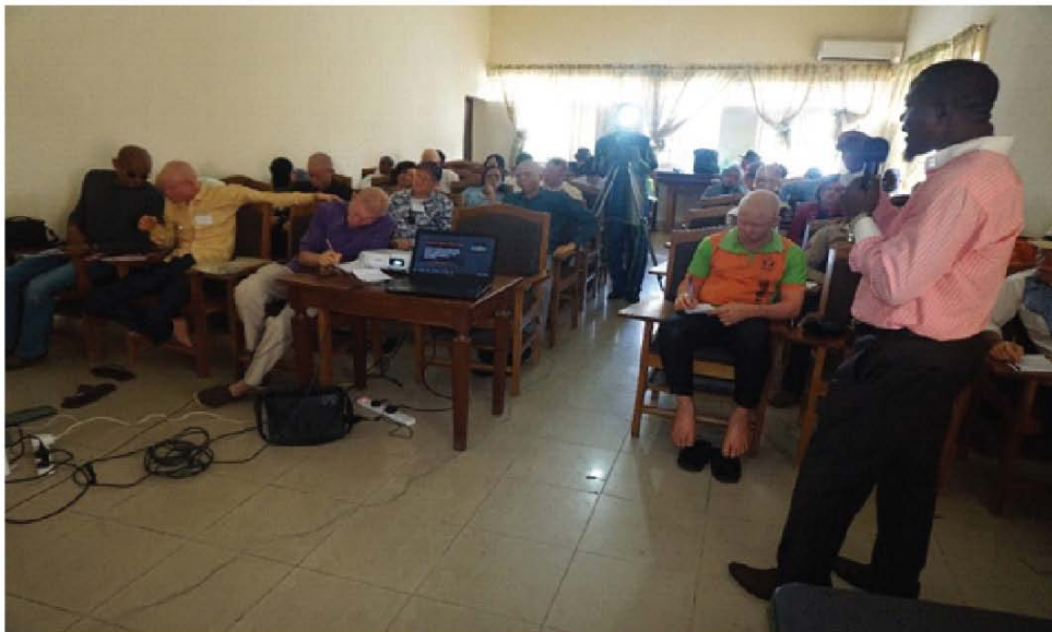
Participants at a capacity building workshop for leaders of PWA in the North Central Region

The workshop papers presented included: Albinism as a human rights issue; Human rights Advocacy and engagement; Persons with Albinism and the UN Convention on the Rights of persons with disabilities; Monitoring and reporting the human rights abuses of persons with Albinism; Leadership as a tool for Promoting and protecting the Human Rights of Persons with Albinism; and Human Rights based approach to project management.