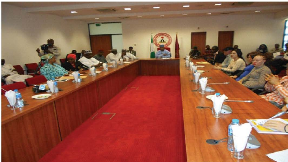
Advocacy visit to the Senate President

Finally, there was a technical workshop to further educate and sensitize PWA, parents and members of the public who were present at the event on how to mitigate the health challenges facing PWAs. The topics treated at the workshop were; “Skin Cancer Prevention in Albinism” ; “Managing Low Vision in Albinism” and “Confidence-Building in Persons with Albinism” .