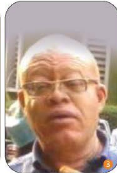
Alhaji Shehu Shagari GCFR 1 Grand patron