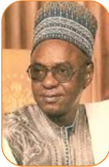
HE Alh. Shehu Shagari, GCFR Grand Patron, The Albino Foundation

“Though, there are signs of positive responses and attitudes from members of the public and some agencies of the government, unfortunately, this has not yet translated into the desired result that will totally eradicate the abuse being experienced by persons with albinism at home and in their quest to access social services in Nigeria.”