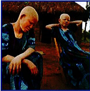
Tanzanian Children With Albinism

She continues, “Tanzania and other neighboring countries share similar beliefs surrounding Albinism as Uganda, which have allowed witchdoctors in these countries to exploit these superstitions in order to pursue their own economic gains.” “When a group is defined as anything less than human, acts of discrimination become acceptable. The most devastating construct in Tanzania and Burundi is the myth that certain body parts of an albino person can bring wealth.”