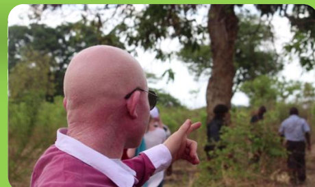
They took her from the house to that bush where they cut off her hand