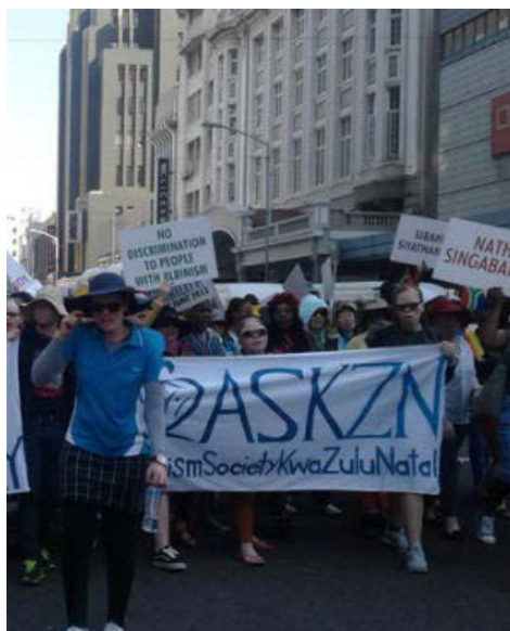
Hundreds of people with albinism marched in Durban on Wednesday.

"There have been attacks and killings directed [at] people with albinism. Our people still go missing without a trace. They are brutally killed and buried