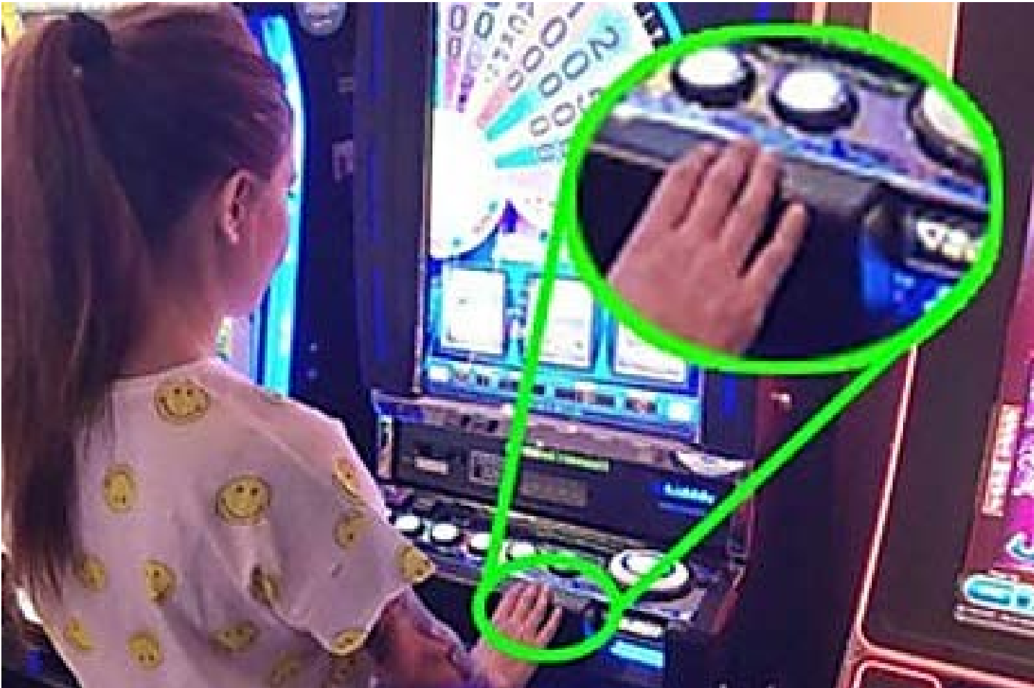
Daily Buzz Trends