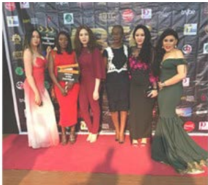
Albinism: Foundation champions movie to fight stigma In "Arts & Entertainments"