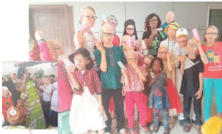
Succour for albinos In "Inside Abuja"