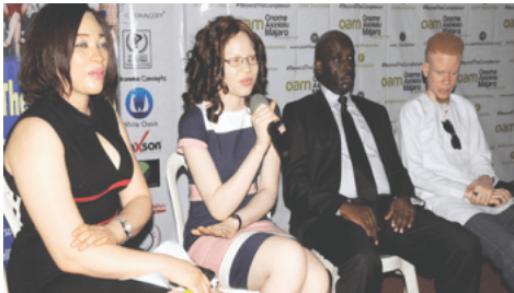
‘Skin cancer, major threat to survival of albinos’ In "Health"