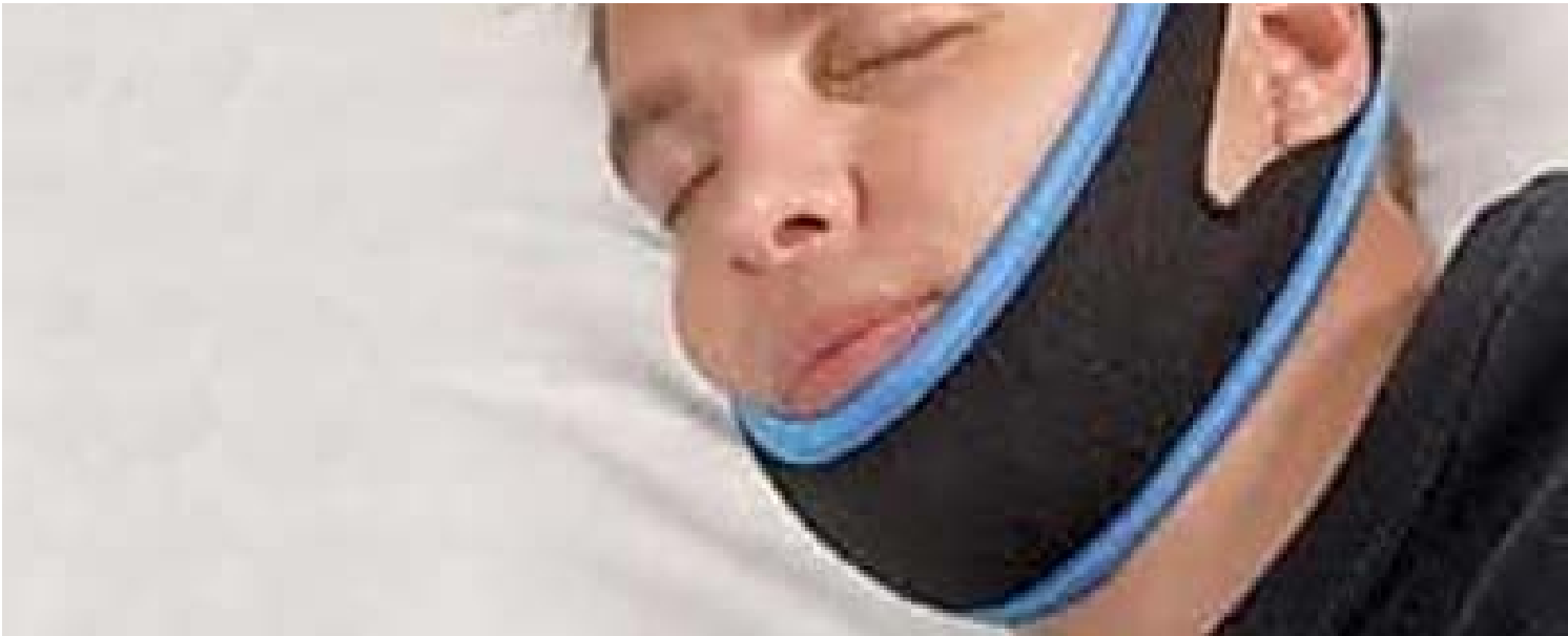
My Snoring Solution