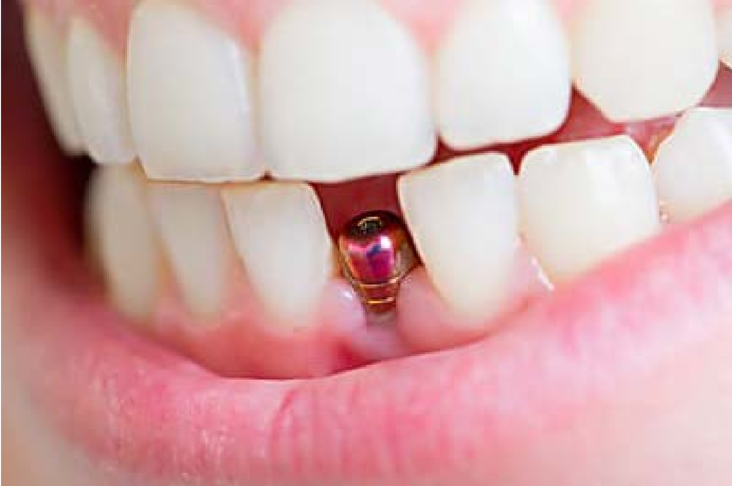
Dental Implants | Sponsored Links

Sponsored Links by Taboola ▶ You May Like