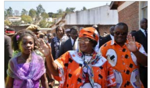
Does Joyce Banda Stand a Chance in 2019 Malawi Elections?