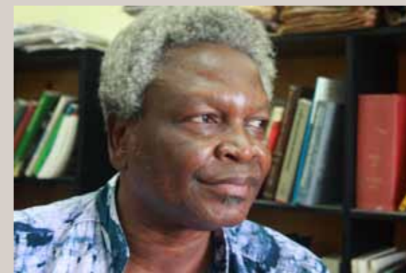
“The purpose was to help albinos mobilize”