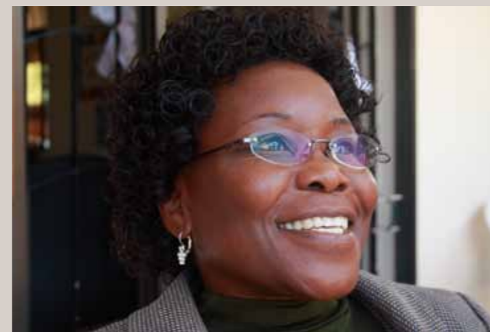
"Persons with albinism are just ordinary people"

When first rumours then credible reports of albinos being murdered for body parts began two years ago, Ntetema felt it was her duty as a journalist to investigate.