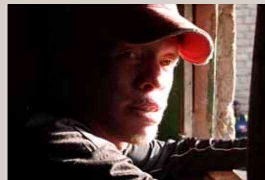
“If you don’t go out in the sun, you don’t eat”