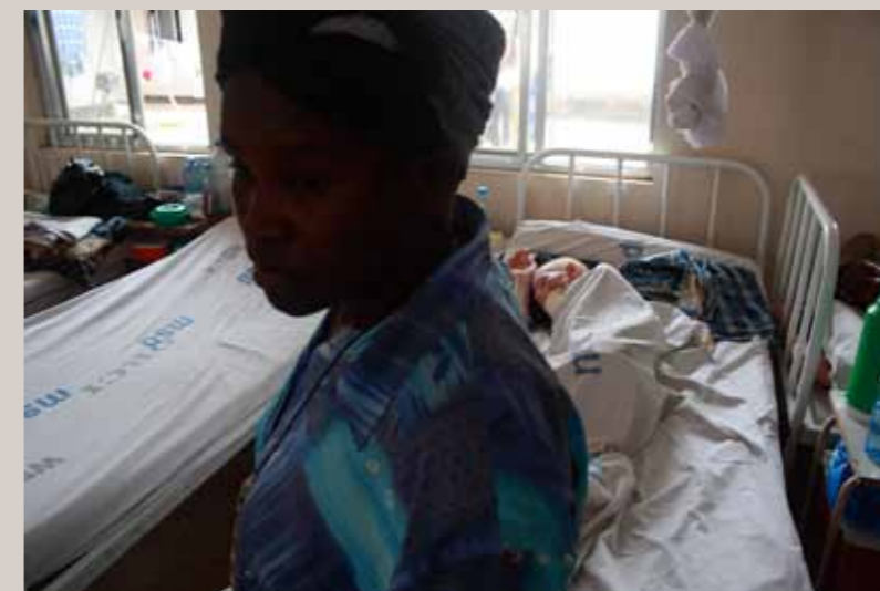
“He’s been saying his goodbyes”